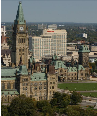
The Westin Ottawa and Parliament Hill

MERLOT announces the upcoming International Conference on “ Working With and Learning from the World’s Best. ” This year’s annual meeting (MIC06) will be held in Ottawa, Canada, from August 8-11, and is hosted by the Co-operative Learning Object Exchange (CLOE) and the University of Ottawa.